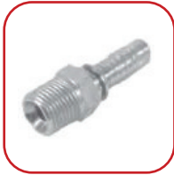
CAMLOCK TYPE A