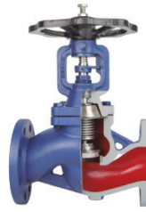
BELLOW SEAL VALVES