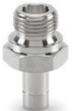
MALE ADAPTER (BSPP)