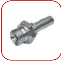
CAMLOCK TYPE B