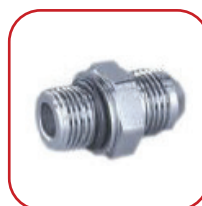
MALE CONNECTOR m Metric X m SAE