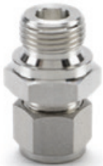
MALE CONNECTOR (BSPP) BONDED WASHER SEAL