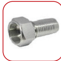
CAMLOCK TYPE D