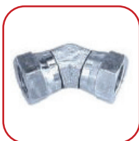
45° SWIVEL CONNECTOR f JIC X JIC