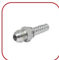
SAE MALE 45° CONE