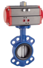
BUTTERFLY VALVE WITH ACTUATOR