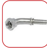
CAMLOCK TYPE C