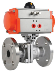
BALL VALVES WITH ACTUATOR