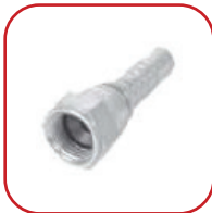
CAMLOCK TYPE B