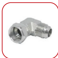
90° SWIVEL CONNECTOR m JIC X JIC