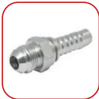
CAMLOCK TYPE A