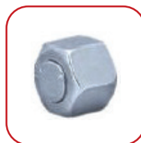
SWIVEL CAP JIC