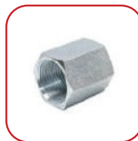
FEMALES CONNECTOR f BSP