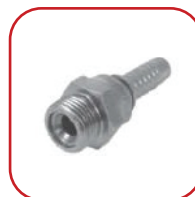
SAE MALE BOSS SWIVEL O-RING