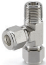
MALE RUBBER TEE