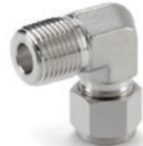
MALE ELBOW (NPT)