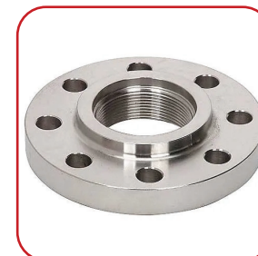
STAINLESS STEEL THREADED FLANGES