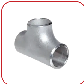
STAINLESS STEEL STRAIGHT TEE