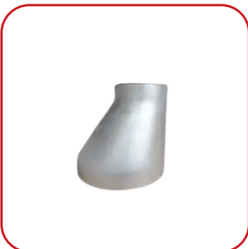
STAINLESS STEEL ECCENTRIC REDUCERS