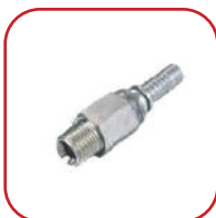
NPT MALE SWIVEL