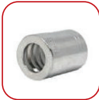
NO SKIVE R2T/2SN