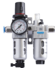
AIR FILTER REGULATORS