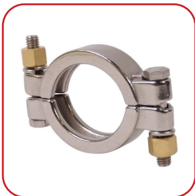
DOUBLE BOLT CLAMP