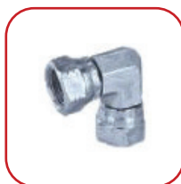
90° SWIVEL CONNECTOR f JIC X JIC