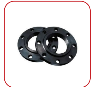
CARBON STEEL SLIP ON FLANGES