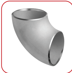
STAINLESS STEEL ELBOW 45°