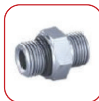
MALE CONNECTOR m BSP X m BSP