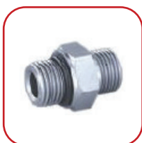
MALE CONNECTOR m Metric X m SAE