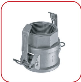
CAMLOCK TYPE D