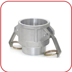
CAMLOCK TYPE B