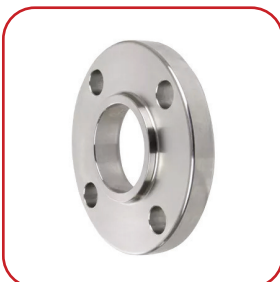
STAINLESS STEEL SOCKET WELD FLANGES