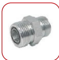
MALE CONNECTOR m BSP X m ORFS