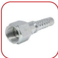
CAMLOCK TYPE B