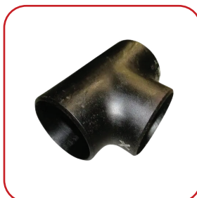
CARBON STEEL STRAIGHT TEE