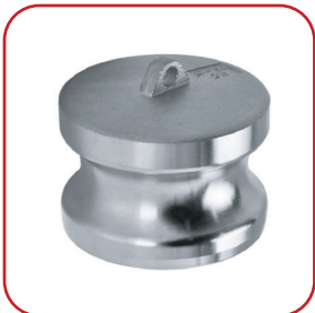
CAMLOCK TYPE DP