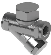
THERMODYNAMIC STEAM TRAP