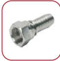
CAMLOCK TYPE C