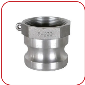
CAMLOCK TYPE A