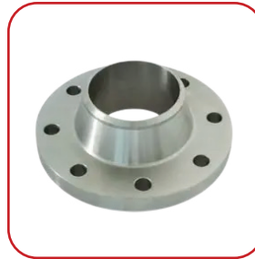
STAINLESS STEEL JIS/ MARINE FLANGES 16K