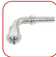
CAMLOCK TYPE C