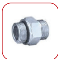
MALE CONNECTOR m Metric X m Metric