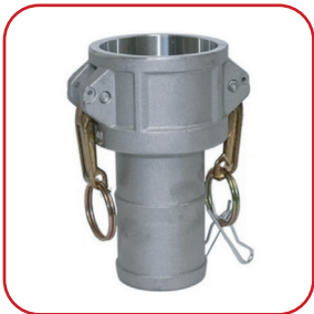
CAMLOCK TYPE C