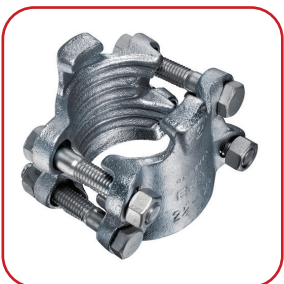
FOUR BOLT CLAMP