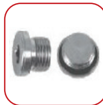
HOLLOW HEX PLUG Metric