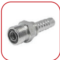
CAMLOCK TYPE A