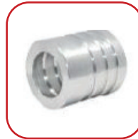
SKIVE DIN 20023 4SH, R12/32 HOSE