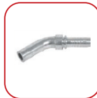
45° METRIC STANDPIPE