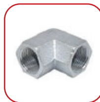
90° ELBOW FEMALE BSP