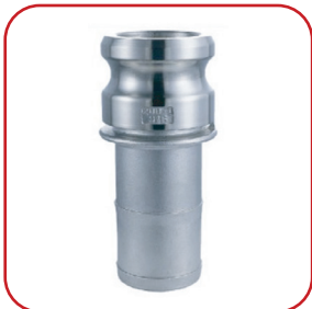
CAMLOCK TYPE E