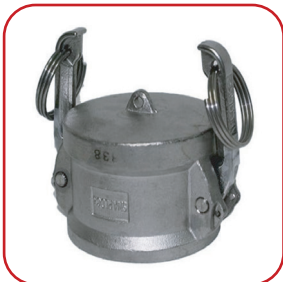
CAMLOCK TYPE DC