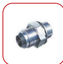
MALE CONNECTOR m Metric X m Metric