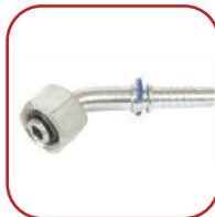
45° METRIC FEMALE 24° O-RING CONE L/S