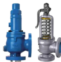
PRESSURE SAFETY / RELIEF VALVES