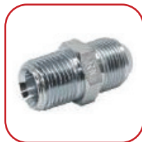
MALE CONNECTOR m Metric X m NPT