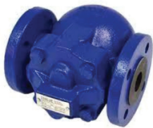
BALL FLOAT STEAM TRAP