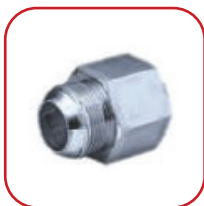
MALE FEMALE CONNECTOR m JIC X f BSP