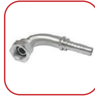
CAMLOCK TYPE D