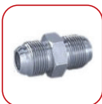
MALE CONNECTOR m Metric X m Metric