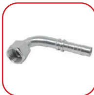
CAMLOCK TYPE D