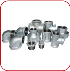
MALLEABLE IRON PIPE FITTING