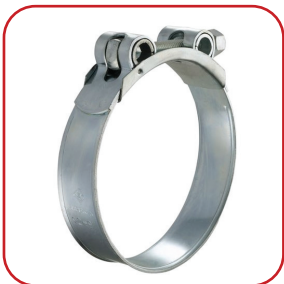
SINGLE BOLT CLAMP