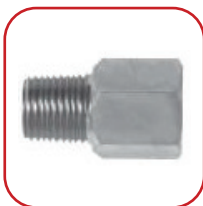
MALE FEMALE CONNECTOR m BSPT X f BSPT