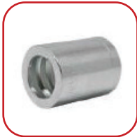
NO SKIVE R1T/1SN