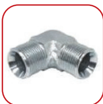
m BSP X m BSP