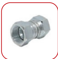
SWIVEL CONNECTOR f JIC X f JIC