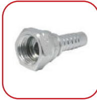
CAMLOCK TYPE D