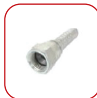
SAE FEMALE 45° CONE