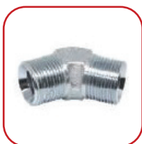
45° ELBOW CONNECTOR m BSP X m BSP