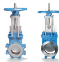
KNIFE GATE VALVE