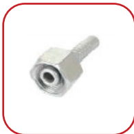
METRIC FEMALE 24° O-RING CONE L/S