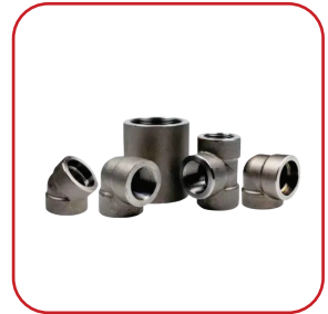
CARBON STEEL THREADED