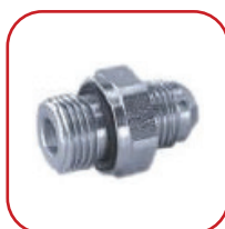
MALE CONNECTOR m Metric X m Metric