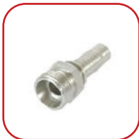
METRIC MALE 24° CONE L/S