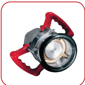
DRY BREAK COUPLING