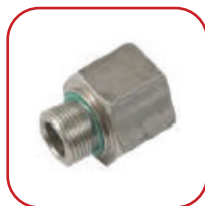
MALE FEMALE CONNECTOR m BSP X f BSP