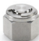
FITTING END PLUG