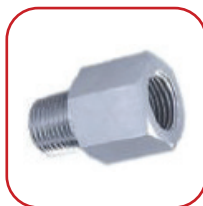
MALE FEMALE CONNECTOR m BSPT X f BSP