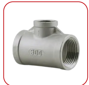
STAINLESS STEEL REDUCER TEE