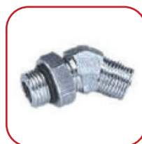
ADJUSTABLE 45° ELBOW m BSP X m BSP