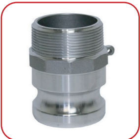
CAMLOCK TYPE F