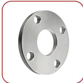
STAINLESS STEEL JIS/ MARINE FLANGES PN6