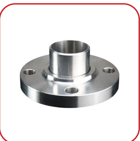
STAINLESS STEEL LAP JOINT FLANGES