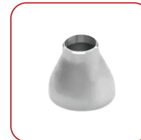
STAINLESS STEEL CONCENTRIC REDUCERS