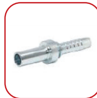
METRIC STAND PIPE