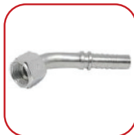
CAMLOCK TYPE C