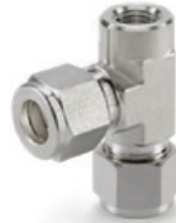
FEMALE RUBBER TEE