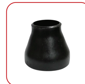
CARBON STEEL CONCENTRIC REDUCERS