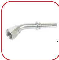
CAMLOCK TYPE D