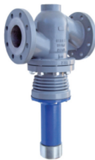
PRESSURE REDUCING VALVE