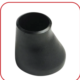
CARBON STEEL ECCENTRIC REDUCERS