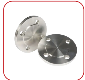
BLIND FACE FLANGES