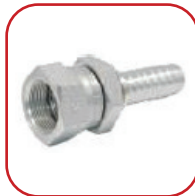
CAMLOCK TYPE C