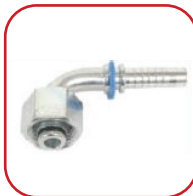
90° METRIC FEMALE 24° O-RING CONE L/S