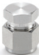
TUBE END CAP