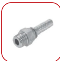
SAE O-RING MALE