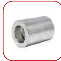
SKIVE R9,4SP.4SH/10-16 R12/06-16