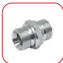
MALE CONNECTOR m BSP X m BSP